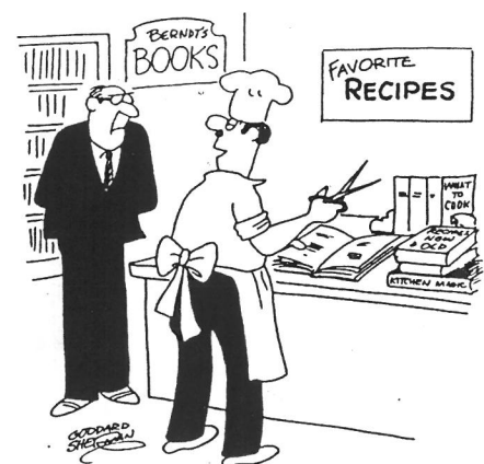
"Just browsing, thanks."