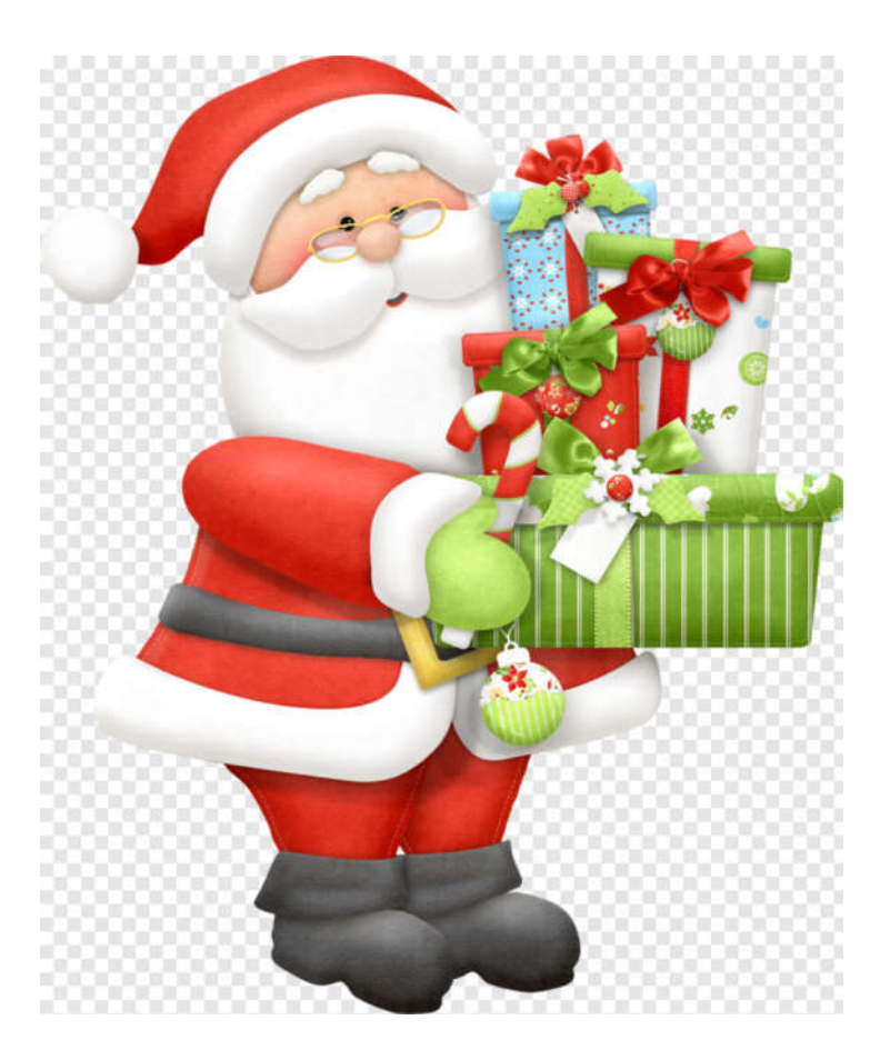
May all your gifts be the Ham Equipment you have been waiting for!