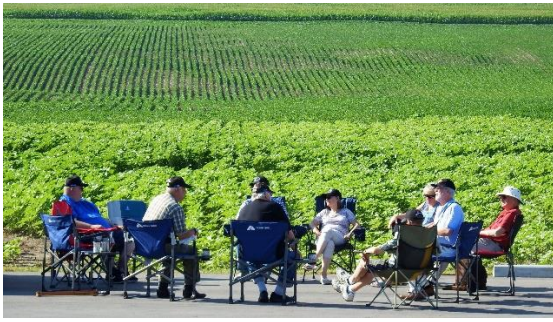
Great morning at

WFF, 12 in all and a K9. A slight east wind brought the aroma from the chicken barns but only for a while. Nothing special going on only mix of conversations and Laird VE3LKS had some equipment to pass on. On the farm front, they have cut a path through the sunflower patch for better viewing. Guess we might have to setup at the back of the lot so we don't block the path entrance, someone will be happy. (Thx for the pictures and story Joe VE3VGJ )