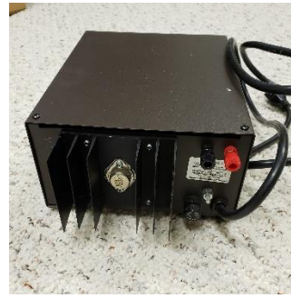
Astron RS-10A power supply. (Linear, 10 amps.) Never used at all.